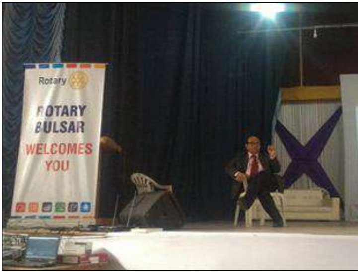
SEX AWARENESS & IT'S MYTH SEMINAR