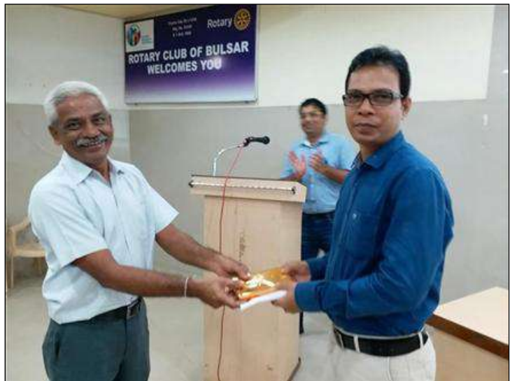
EYE DONATION AWARENESS PROGRAM