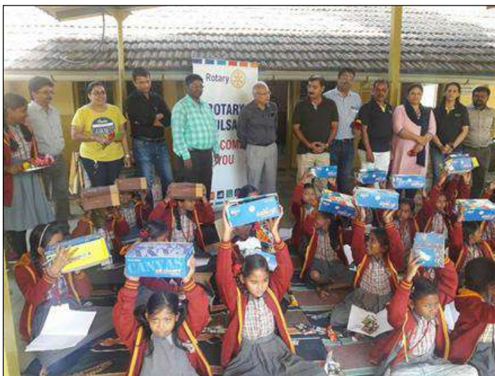
SHOES & SWEATER DISTRIBUTION