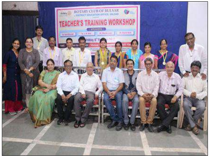
TEACHER'S TRAINING WORKSHOP