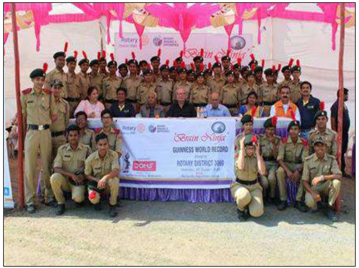
BRAIN NINJA QUIZ COMPETITION