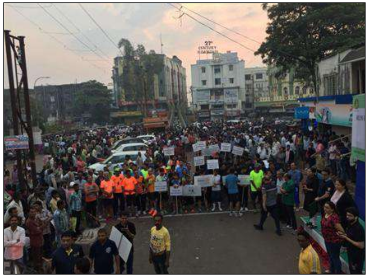
RUN FOR LITERACY