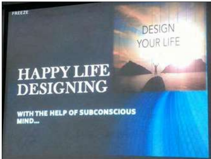
HAPPY LIFE DESIGNING SEMINAR