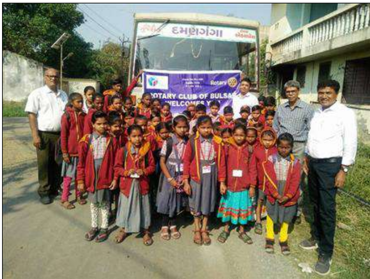
VISIT TO DHARAMPUR SCIENCE CENTER & MUSEUM