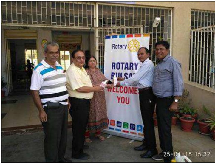
DENTAL CAMP & WASH IN SCHOOL