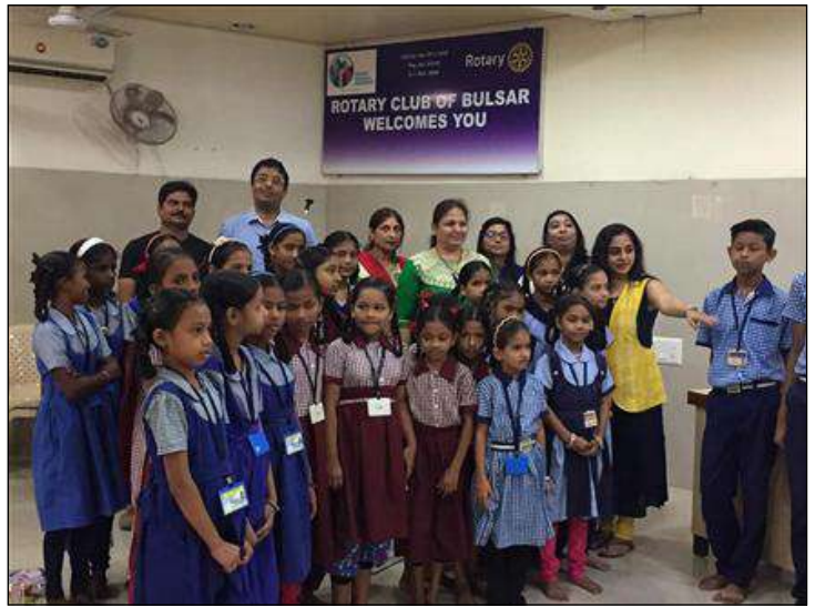
DRAWING & ESSAY WRITING COMPETITION