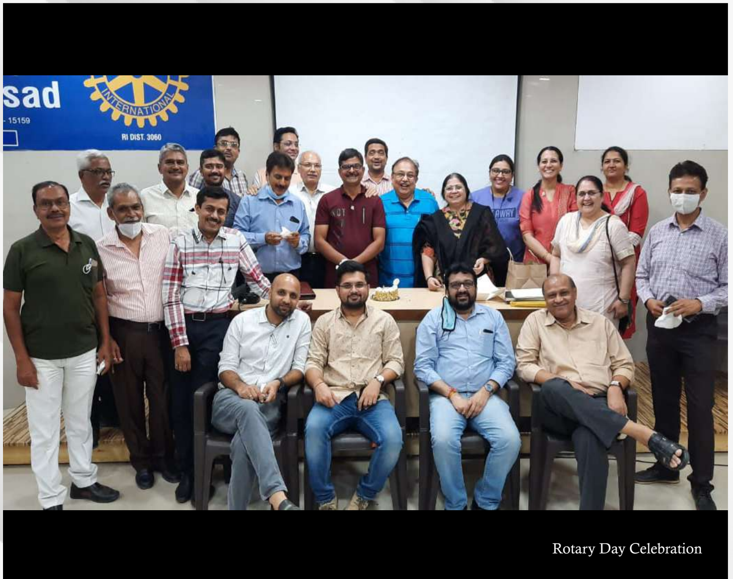
Rotary Day Celebration