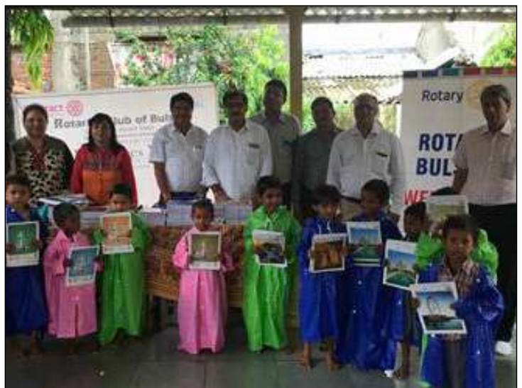
RAINCOAT & BOOKS DISTRIBUTION