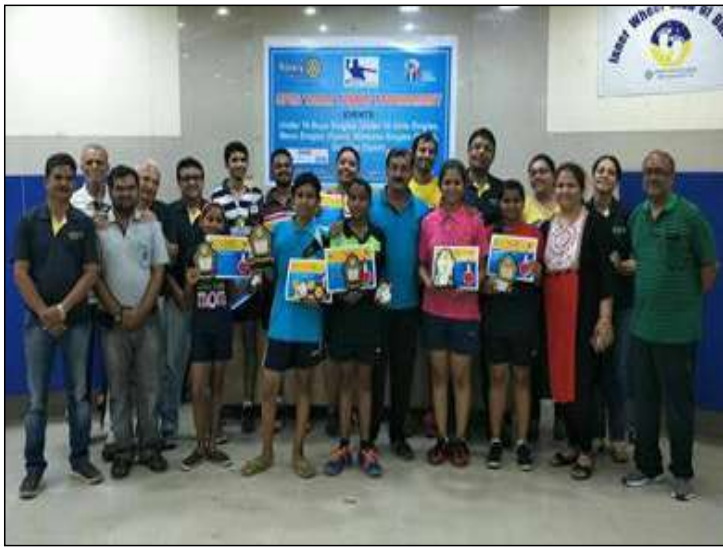
TABLE TENNIS TOURNAMENT