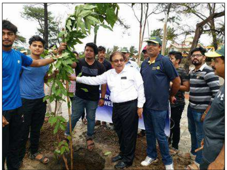
TREE PLANTATION AT TITHAL