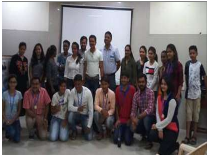
ROTARY QUIZ COMPETITION