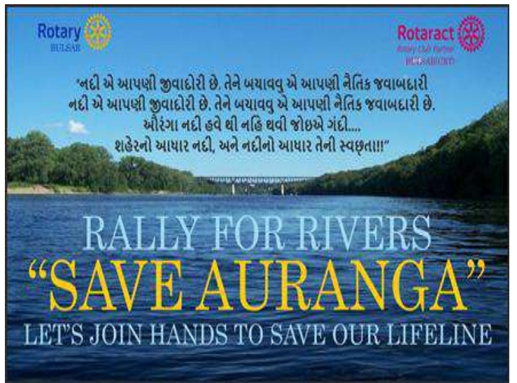
SAVE OUR RIVERS - RALLY FOR RIVERS