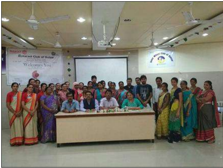
CREATIVITY IN CLASS PROGRAM