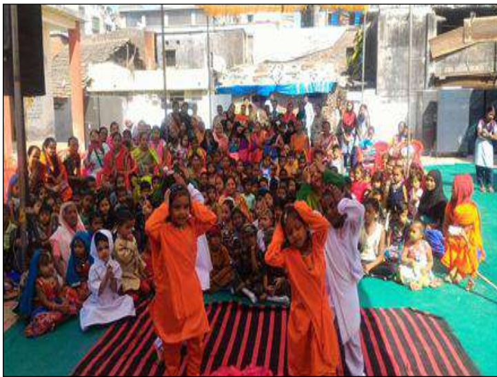
ANNUAL DAY AT ANGANWADI